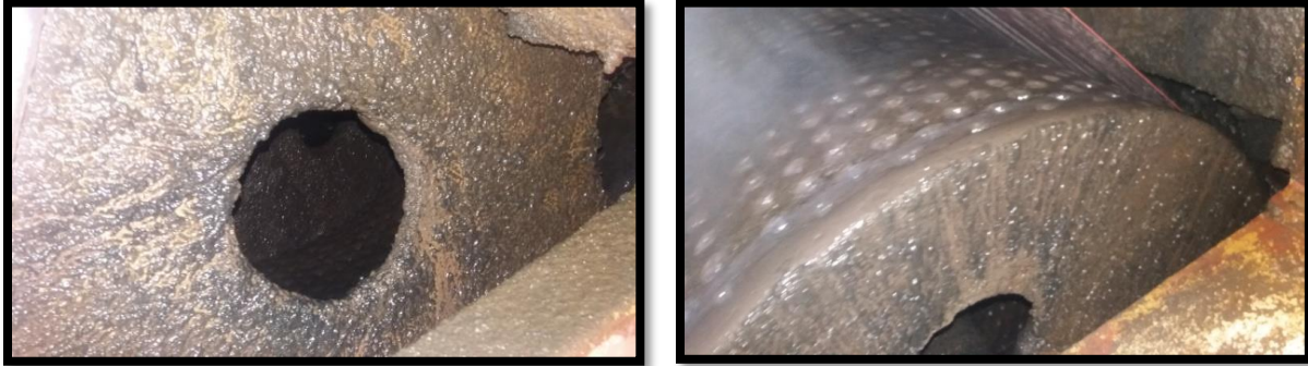
Figure 5: Final condition on 1st March 2018

Several pictures, taken on 1 st March 2018, were made available for review. These pictures (Figure 5), taken at the end of the 6-month test period, appeared to show softened and reduced scaling.