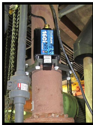
Figure 1: Installed HydroFLOW unit (Model 160i) at a wastewater treatment plant

The HydroFLOW I Range is powered by the patented Hydropath technology. When properly installed on a pipe (see Figure 1), it induces a 150 kilohertz, oscillating sine wave, alternating current (AC) signal. The electric induction is performed by a special transducer connected to a ring of ferrites. The pipe and the flowing fluid act as a conduit, which allows the signal to propagate. The induced AC signal is believed to cause the mineral ions that make up struvite (magnesium, ammonium, and phosphate) to form loosely held together clusters. When certain conditions are created (e.g., pressure change, temperature change, and turbulence) the clusters precipitate out of solution and form stable crystals of struvite that remain in suspension. The crystals are not able to adhere to surfaces as hard scale and are carried away with the flow. Because hard scale no longer accumulates, the shear forces created by the flowing liquid erode and soften existing scale deposits over time. It is important to note that constant liquid flow is required to remove hard scale deposits from a system.