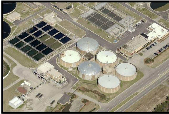
Figure 2: The J. P. Messerly Water Pollution Control Plant

The WPCP (see Figure 2) is one of four wastewater treatment plants that serve the City of Augusta's service population. It is managed, operated, and maintained by the City's Water and Sewer Department. The WPCP, designed for 46 mgd, currently treats an average flow of 20 mgd.